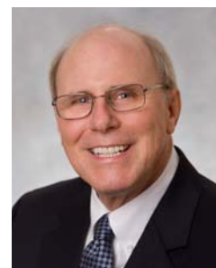
Leighton Yates Holland & Knight LLP