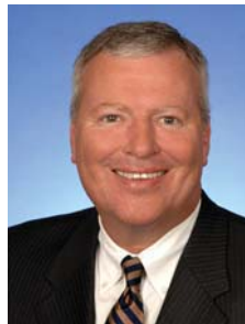
Buddy Dyer Mayor, City of Orlando