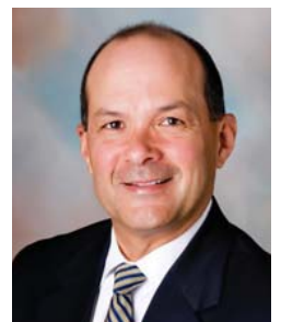
Orlando Evora Greenberg Traurig