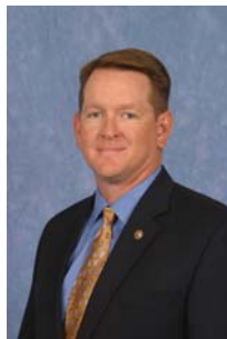
Michael Teague, Mayor

"The City of Edgewood businesses are compatible with immediately adjacent residential areas, while addressing the Community Master Plan issues of Urban Design Standards for the Commercial District."