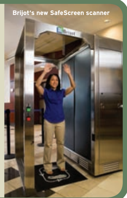
Brijot's new SafeScreen scanner

The SafeScreen portals are safer than what is currently in place for outbound passengers in most airports in that they emit no radiation; they work by reading the natural energy that emanates from a person's body and highlighting any anomalies. They also protect individuals' privacy because they don't display anatomical details.