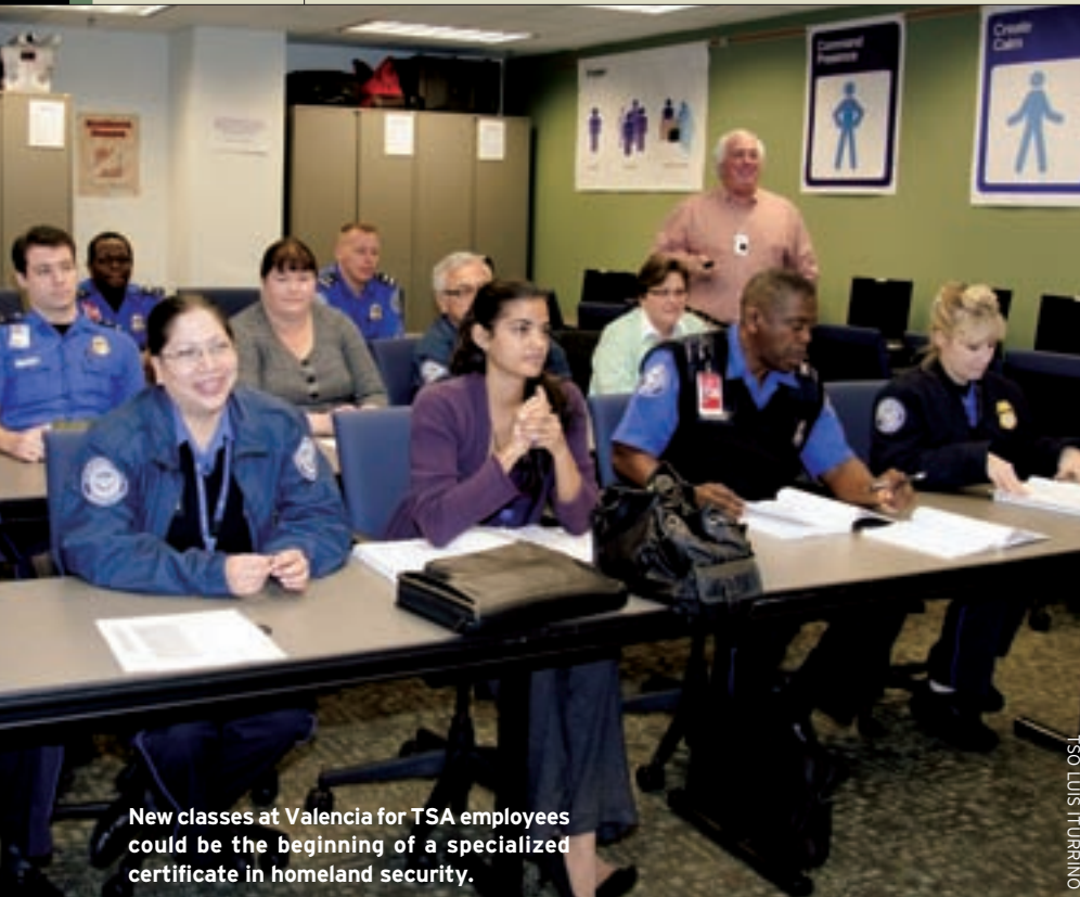
New classes at Valencia for TSA employees could be the beginning of a specialized certificate in homeland security.

THE FIRST OF ITS KIND IN FLORIDA, A NEW PROGRAM AT VALENCIA COMMUNITY COLLEGE, DEVELOPED WITH THE DEPARTMENT OF HOMELAND SECURITY, IS HELPING TO EDUCATE LOCAL AIRPORT SECURITY PERSONNEL.